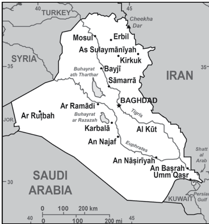
Figure 1. Map of Iraq.

Ottoman Turkey. In effect, the political structure of the region has moved to a situation increasingly in line with the fractured historical, economic, and social reality on the ground.