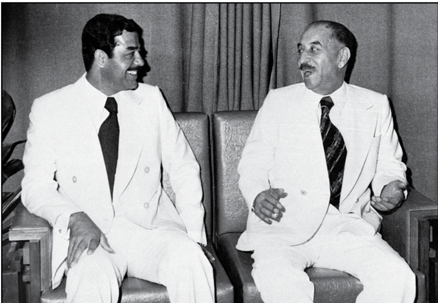
Figure 5. Then Iraqi Vice President Saddam Hussein with Iraqi President Ahmed Hassan al-Bakr in November 1978.

In many respects the odyssey of the Ba'th Party provides an object lesson for the progression of authoritarian government in the region. Although dominated by Michael Aflaq, Saladin al-Bitar, and the 'civilian committee,' the internal functioning of the party was more or less representative; from 1954 to 1958, it emerged as another of the civilian parties vying for power in Syria. The message of the party was particularly attractive to minorities because calls for a 'secular' state in which confessional identity played as a requirement for political, economic, and social position was eliminated. In the aftermath of the Ba'thist coups in Iraq and Syria in 1963, the path to