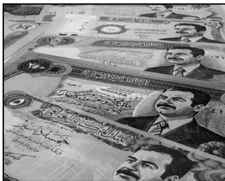
Figure 7. Central Bank of Iraq currency in 2003.

From a Syrian perspective, the U.S. invasion of Afghanistan was a logical reaction to the events of 9/11; the attack on Iraq was something else. Despite frictions over Palestinian issues and the intifada against the continuing Israeli occupation, in the aftermath of 9/11, there was a significant degree of intelligence cooperation between Syria and the United States. Radical Sunni fundamentalism was an enemy to both. With the invasion of Iraq, U.S. policy became more problematic for the regime in Damascus. The U.S. and its Global War on Terror now lumped Hamas and Hezbollah together with al-Qaeda. On 6 November 2001, President Bush stated in a speech, “You’re either with us or against us in the fight against terror.” 165 Bashar Assad and the Syrian government were ‘with us’ on the issue of al-Qaeda and ‘against us’ on the issue of Palestine, Hamas, and Hezbollah.