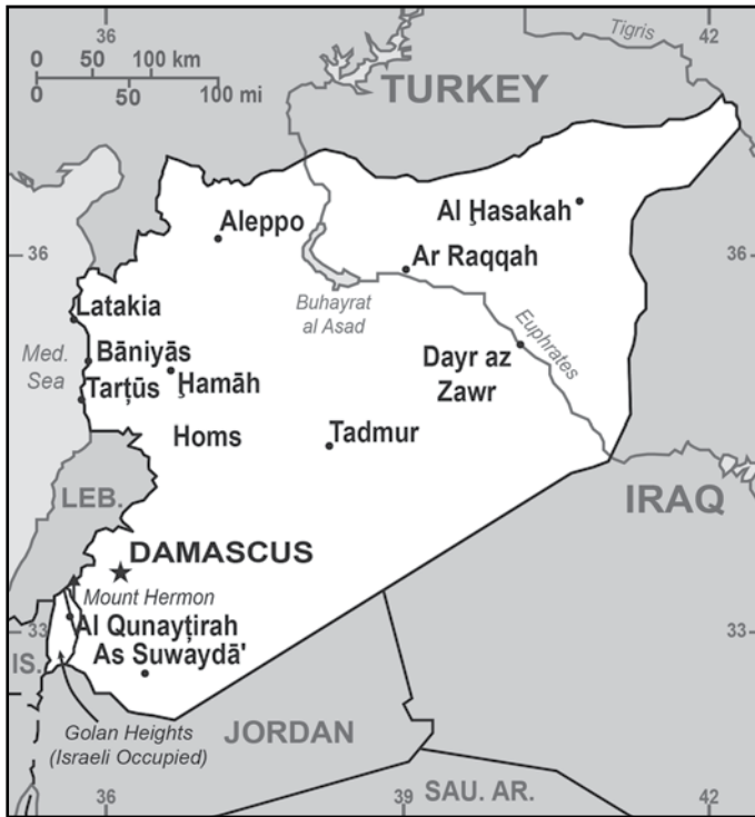
Figure 2. Map of Syria.

Alexander the Great, the Romans, the Parthians, and others) ruled the region. All of these empires had two things in common. First, when in control of the region or part of it, the more successful empires basically sought allegiance or at least quiescence to their rule in return for a level of non-interference in their affairs in the individual communities that reside there. In other words, local morays and traditions were in most cases largely left alone to develop and function with their own particular tradition as long as they did not threaten stability or security. For the most part, ruled and rulers sought an accommodation as the more practical approach that avoided the often calamitous costs of resistance, revolt, and re-conquest. This meant the heterogeneous nature of the region was fostered at every level—diversity under an umbrella of political authority.