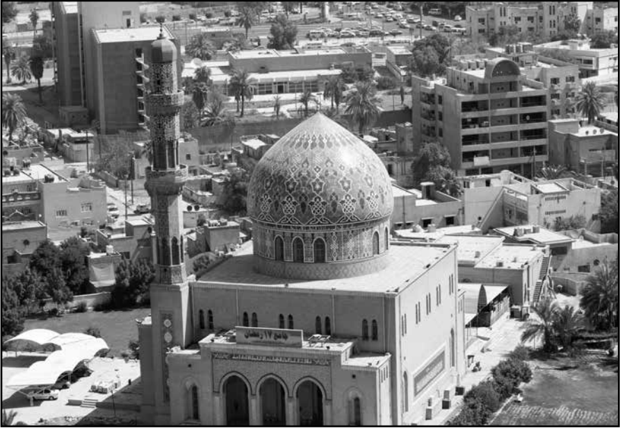
Figure 8. Ramadan Mosque in Baghdad, Iraq.

switching sides and fighting with the Americans to eliminate al-Qaeda, the U.S. abandoned Sunnis to their Shi'a enemies.