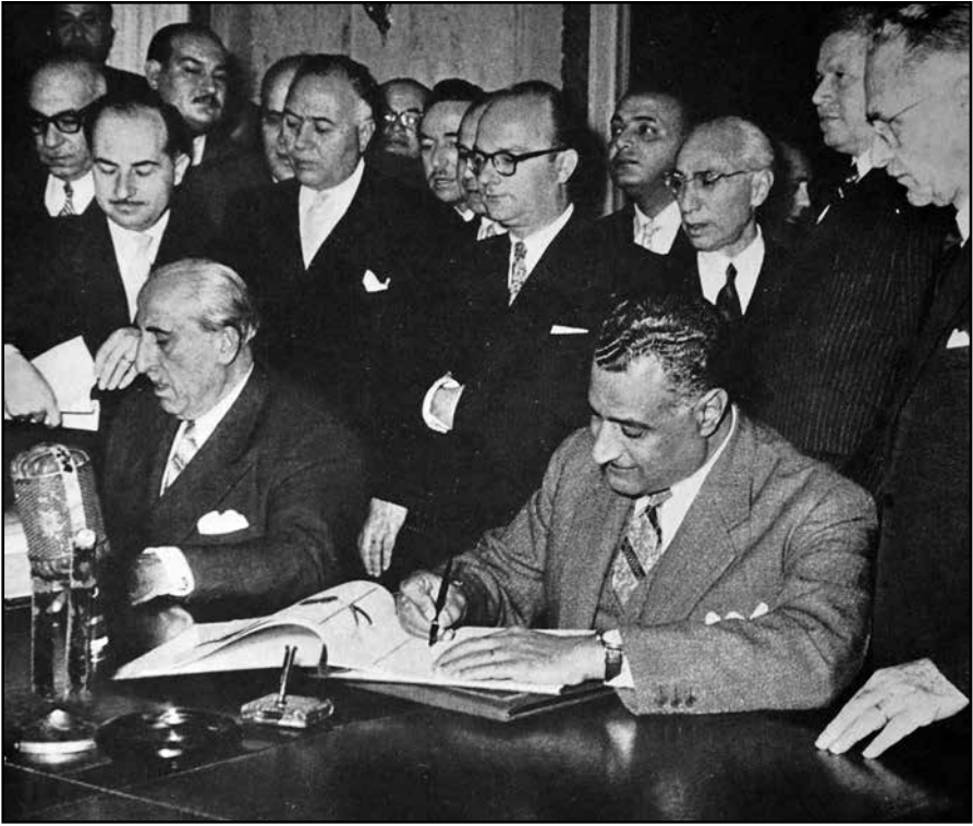
Figure 4. Jamal Abd-al-Nasser signs the unity pact with Syrian president Shukri al-Quwatli, forming the United Arab Republic, February 1958.

and to heighten the focus on “Arab unity.” 57 It also gave the Egyptian president a leg-up on his rival, Nuri Pasha al-Sa’id, in Baghdad.