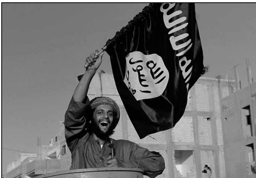
Figure 9. An ISIS militant waves an Islamic State flag during a parade in Raqqa province in Syria.

Beheadings aside, ISIS is winning the consolidation battle in the Sunni areas by providing basic services and stability that neither Damascus nor Baghdad can, or most likely will, provide. Mosul now has a fairly stable electrical supply and an operating hotel, and Saddam's palaces have become parks for family strolls. While the West is outraged by the destruction of archeological sites and ISIS' brutality, but cannot bring itself to do something about the brutality of Assad or the Iraqi Shi'a militias, the Sunnis have the first stability they have known in over a decade in many areas. 200 What appears to be insanity on the part of ISIS is a rationally thought out policy that at its core supports extreme Hanbali logic, undermines the secularist national agenda, brings in funding by quietly selling antiquities, and adds shock media exposure. 201 It is not lost on ISIS that ideologically secular leaders like the Assads and Saddam Hussein used the ancient past to mute sectarian differences in a narrative that linked the pre-Islamic past to the present. 202