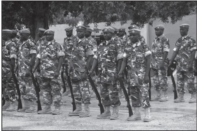
Figure 6. Police Units of the African Union Mission in Somalia (AMISOM) stand in position after concluding training in the Somali capital Mogadishu.

There are squabbles both within AMISOM and with other parts of the international community as well. The East African newspaper ran a story that mentioned the rivalry among AMISOM troops from different countries, and contended that an arms race was ongoing between Uganda and Ethiopia. 560