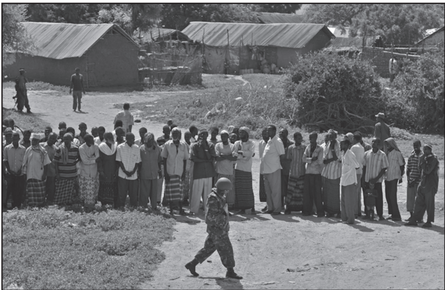
Figure 4. Kenyan Defence soldier and villagers in Burgabo, Southern Somalia.

Think of Sheikh Sharif Sheikh Ahmed who was a prominent member of the ICU before it collapsed after an attack by the U.S.-supported Ethiopians. 129 Ahmed then partnered with Sheikh Hassan Dahir Aweys to form the Alliance for the Re-liberation of Somalia, though the two eventually had a falling out. 130 Aweys’ name can now be found on page three of a U.S. Treasury Department report listing Specially Designated Terrorists, 131 while