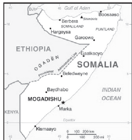
Figure 1. Map of Somalia. U.S. State Department map.

Somalis still make irredentist claims on the three areas outside of Somalia’s borders, 30 as most prominently symbolized by the five points of the star on the Somali flag—each point