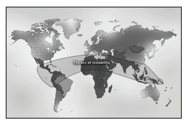
Figure 1. Arc of Instability (Created by USSOCOM Graphics)

resources—including water, food and energy—is becoming a serious problem in much of the world, but particularly along the arc. Demographic factors such as long-term fertility trends, urbanization, migration and changes in the ethnic composition and age profile of populations will influ-