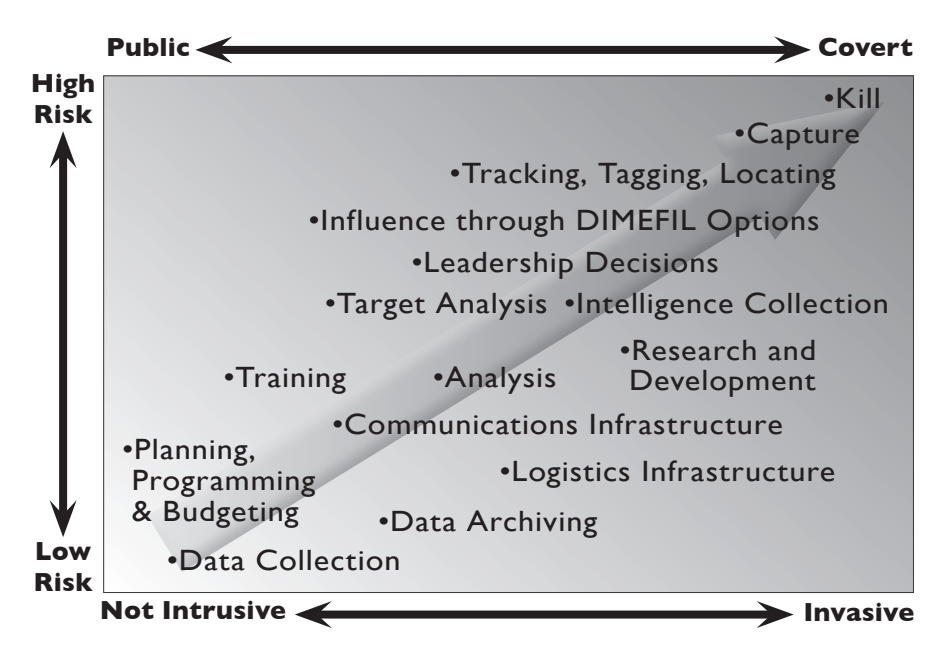
Figure 1. Spectrum of Manhunting-Related Activities

Next on the spectrum one finds infrastructure and logistics—preparatory actions that must take place to enable any subsequent action—conducted in those regions determined most likely to require manhunting activities. Personnel selection, training, and administration of a manhunting force would also fall into this area. Up to this point on the manhunting spectrum, the government has not yet targeted any individuals or human networks.