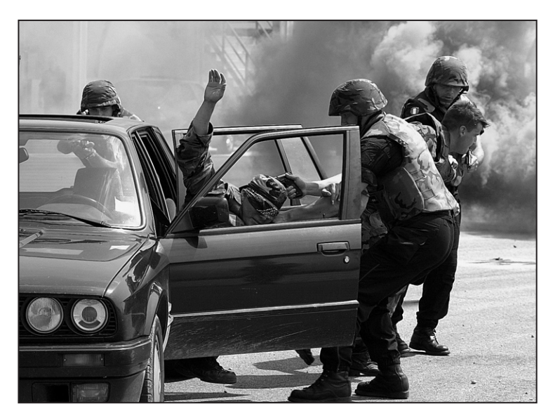
Aviano AB, Italy. Italian Carabinieri (paramilitary police) seize a high value target (HVT) during a joint training exercise with U.S. Air Force security police. The ability to conduct operations in concert with allied internal security forces will be crucial to counter-network and manhunting operations in semipermissive environments.

When conducting counter-network operations on a global scale, it is necessary to carry out activities at tactical, operational, and strategic levels. At the tactical level, it is important to organize forces so that they are best aligned to engage and subdue the enemy. The operational level combines tactical actions into campaigns to defeat networks. The strategic level of a manhunting organization is responsible for orchestrating all of the elements of national power against the enemy, with impact spanning a period of years or decades. Strategic manhunting capabilities must be aligned at three levels: a) departmental or interagency, b) national, and c) international organizations must coordinate and deconflict multiple efforts, bringing each organization's capabilities to bear for best advantage.