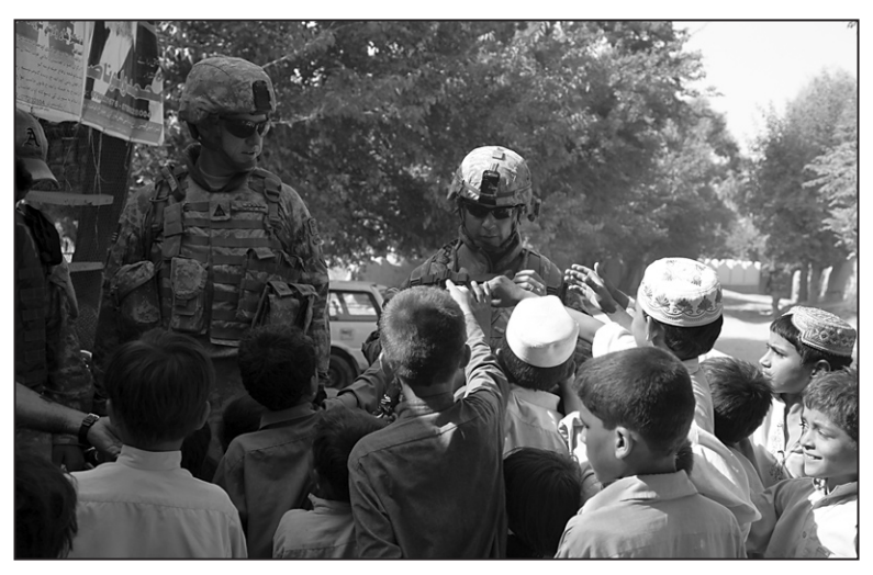
Afghanistan, 2009. Interaction with the local population plays an important role in counter-network operations. Considering every citizen a sensor, an informed, alert civilian population can provide important tip-off information to locate key targets.

Fourth, manhunting is a people- and process-oriented endeavor. In successful operations, technology played only a supporting role. Similarly, the most effective manhunting operations are centered on people with the requisite skills, participating in a mutually understood process to achieve a clearly articulated goal. In some cases, while technology has enhanced this ability, technology has not been the most significant contributor to manhunting; even Predator unmanned aerial vehicles (UAVs) and Hell-fire missiles are merely the respective investigative and lethal arms of a distributed organization, comprising people with a clear process, cued by intelligence. The primary role played by technology has been to extend the span and scope of sensory, mobility, and firepower capabilities and speed communications for the manhunting team.