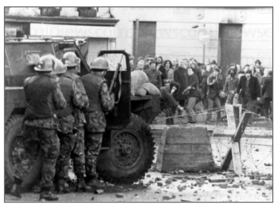
Demonstrators and British troops face each other on Bloody Sunday, 30 January 1972.

on 30 January 1972. As demonstrators from a banned civil rights march in Derry descended into a melee, British troops used rubber bullets and water cannons to contain rowdy youths. In the chaotic scene, the storied Parachute Regiment reportedly responded to sounds of gunfire with its own rifle shots. When the firing stopped, 13 civil-