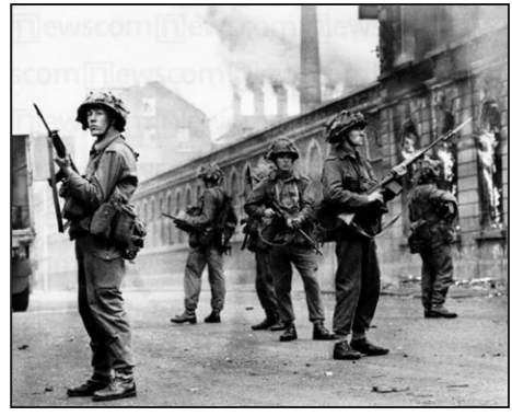
British troops stand guard in Falls Road, Belfast during rioting in August 1969 as a building burns in the background.

Communal tensions came to a head when widespread rioting broke out in Northern Ireland in July 1969. After a month of sectarian strife, the Royal Ulster Constabulary (RUC), a police unit, nearly folded in exhaustion, and Stormont requested and received the deployment of British troops within the province to maintain order. From the Catholic minority viewpoint, the RUC lacked the impartiality of a neutral police force. To offset this Catho-