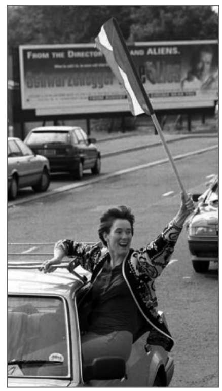
A Republican woman celebrates the IRA ceasefire in Belfast, August 1994.

The shaky truce since 1994 played a role in convincing populations on both sides of the sectarian divide that peace was better than three decades of killings and bombings in their midst.