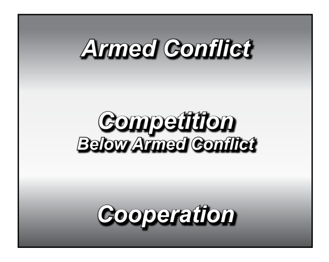
Figure I. Competition Continuum. Sources: JCIC; Department of Defense, Joint Concept for Integrated Campaigning.

remnants of the obsolete peace/war binary conception of the operating environment."<sup>19</sup> Instead, they offer continuum of conflict that allows for progressive, fluid movement across the continuum as interests and circumstances change. Moreover, the authors recognize that two actors can be in simultaneous conditions, such as armed conflict and cooperation, as Ukraine and Russia demonstrate with their forces facing off while still cooperating on oil and gas exports.