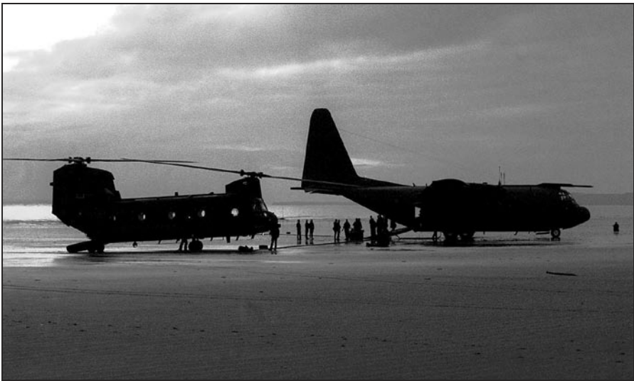
Figure 3. Special Operations C-130 and Chinook. C-130 transloads fuel and personnel to a Chinook at an austere landing zone.

The flying part of special operations aviation is the most difficult to achieve because of resources, manpower, and fiscal considerations. MC 437/1 requires that a national special operations task group possess the ability to infiltrate and exfiltrate using air [emphasis added], land, and sea means into and out of the opera-