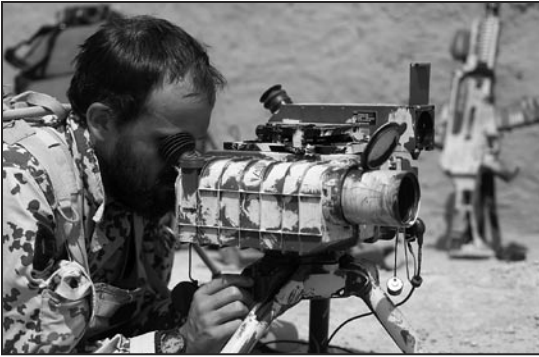
Figure 4. Battlefield Airmen in Action. Special operations terminal attack controller marking a target for a strike by conventional air power. (Used by permission.)

operators from most of the member nations and all the different armed services in the past 4 years indicates that they want and need published NATO standards, whether in AJPs or in NATO Standardization Agreements (STANAGs) to guide the member nations' leadership as they develop and equip air and aviation forces for special operations.