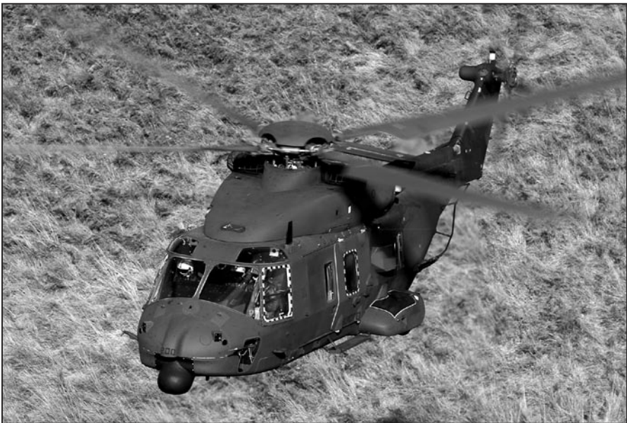
Figure 5. Agusta Westland NH-90 Special Operations Version. The NH-90 gives nations the ability to lift 20 combat loaded troops. It is being produced in a special operations version.

Fielding a diverse force will require NATO standards for interoperability and employment, yet it also offers great opportunities. It becomes the task of the special operations planners, airmen, and commanders to effectively employ the range of capabilities found among the special operations aviation task groups contributed by the nations to an operation.