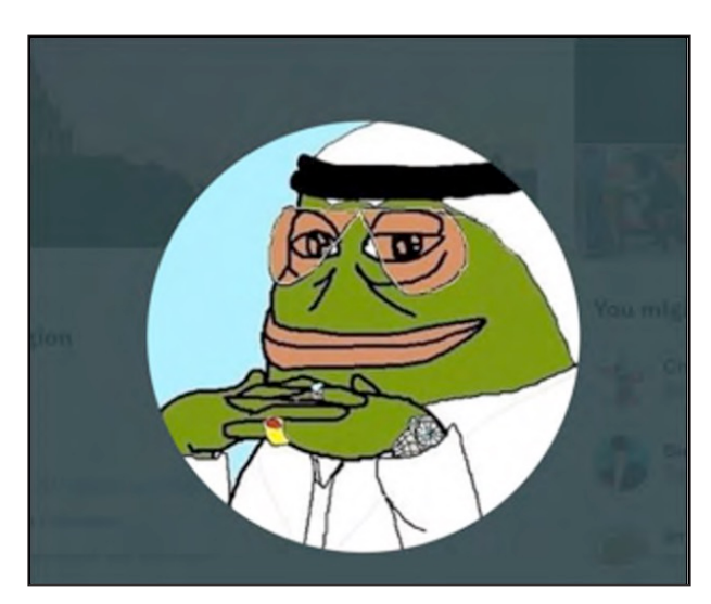
Figure 2: "The avatar used by Abu Anon, an Islamogram influencer with thousands of followers across multiple platforms, such as Instagram, Twitter, Discord and Reddit." <sup>775</sup>

Other images, like the mashup of the Confederate flag with the Islamic State's below, highlight how Islamogram members have blended key visual symbols used by the two communities. This blending of visual aesthetics is not one-sided; far-right extremists have engaged in similar activity.<sup>76</sup>