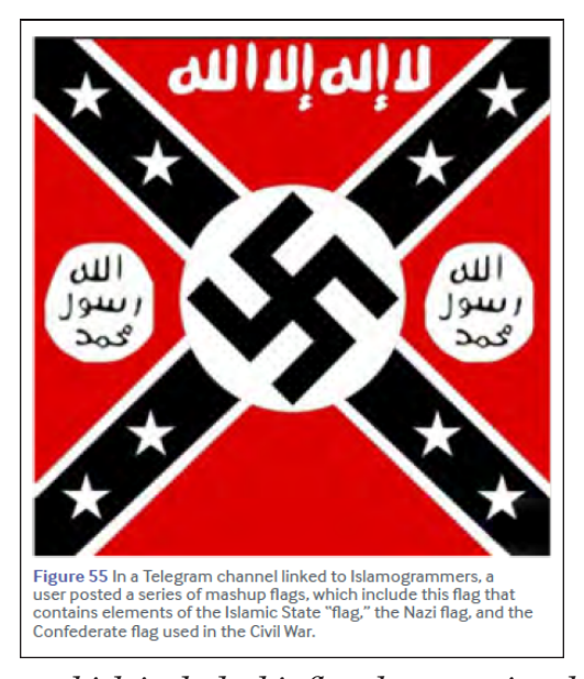
Figure 3: A "mashup of flags, which include this flag that contains elements of the Islamic State "flag," the Nazi flag, and the Confederate flag used in the Civil War" that was posted "to a Telegram channel linked to Islamogrammers."<sup>77</sup>

Other images, like the mashup of the Confederate flag with the Islamic State's below, highlight how Islamogram members have blended key visual symbols used by the two communities. This blending of visual aesthetics is not one-sided; far-right extremists have engaged in similar activity.<sup>76</sup>