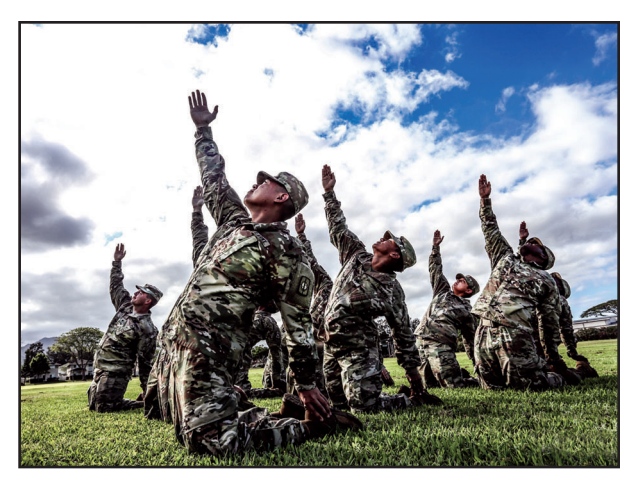
Soldiers from the 25th Infantry Division at Schofield Barracks in Hawaii benefit from Warriors at Ease programs on the installation. Warriors at Ease teachers provide yoga for individual units as well as support special events for posttraumatic stress disorder awareness, suicide prevention, sexual assault prevention and response, and resiliency.

A way forward for addressing male participation is to amplify testimonials from